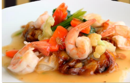
423 Rad Na 190 Kung/Talay

Chinese Noodles in a rich Sauce with Chicken, Pork or Beef