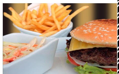
331 Cheeseburger 230

Served with your Choice of French Fries or Onion Rings