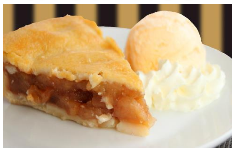
520 Apple Pie 140

Served with Vanilla Ice Cream & Whipped Cream