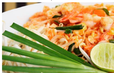
421 Pad Thai Kung Sod 150 ผัดไทยกุ้งสด