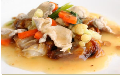
422 Rad Na 150 Gai/Moo/Nua