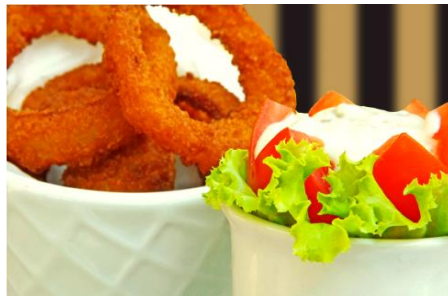
364 Onion Rings 60

Breaded Chicken Strips served with a BBQ & Honey/Mustard Sauce