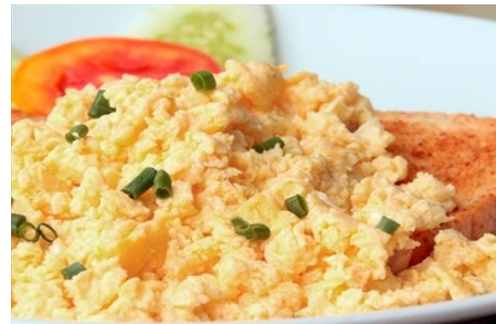
305 Scrambled Eggs 120 Three Scrambled Eggs served on Toast