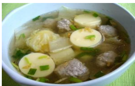
433 Tom JeadWudSen 120