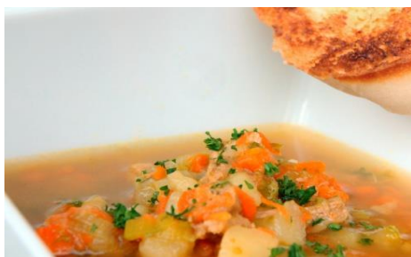
353 Beef-Vegetable Soup 120