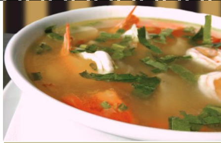
401 Tom Yum 190 Kung/Talay ต้มยำ กุ้ง/ทะเล