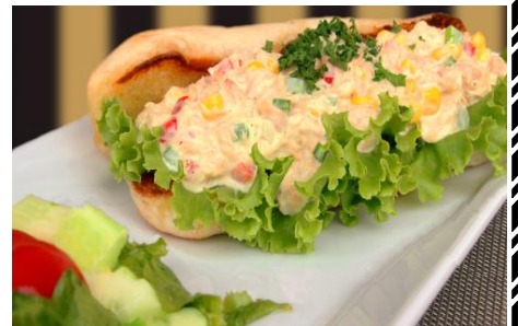
322 Tuna Mayo 150

Classic Club Sandwich served with French Fries