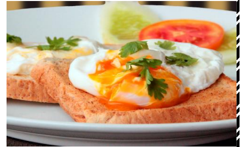
302 Poached Eggs 90 Two poached Eggs served on Toast