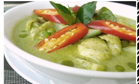
408 Gaeng Keow Wan 150 Gai/Moo/Nua

เนื้อผัดน้ำมันหอย Fried Beef with Oyster Sauce