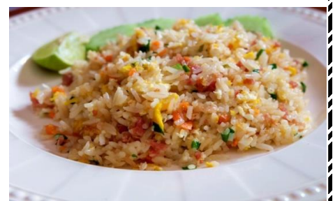
434 Kaow Pad Neab 120