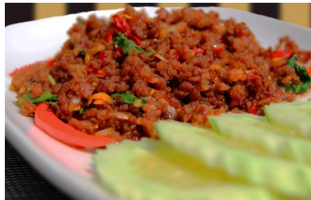
415 Pad Krapao 150 Gai/Moo/Nua กะเพรา ไก่/หมู/เนื้อ

Sautéed minced Chicken, Pork or Beef with Chili & Basil