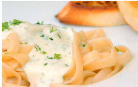
343 Alfredo 170