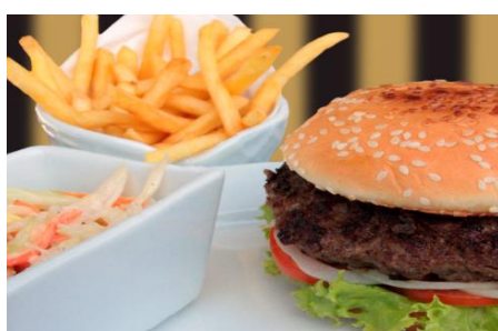
330 Hamburger 190

Beef, Mushroom, Onions, Bell Peppers on a Creamy Cheese Sauce served with French Fries