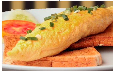
303 Omelet 120 Three Egg Omelet on Toast (add your choice of Ham, Cheese, Mushrooms, Tomato or Spinach at 10 each item)