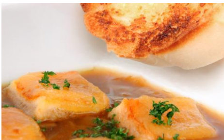
350 Soupe a l'oignon 90