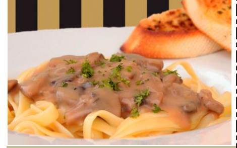
345 Ai Funghi 190