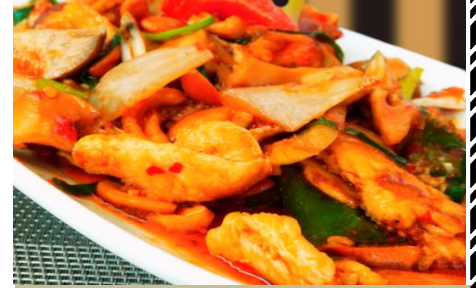
405 Gai Pad Med 190 Mamuang

ผัดเปรี้ยวหวานไก่/หมู Sweet & Sour Chicken or Pork