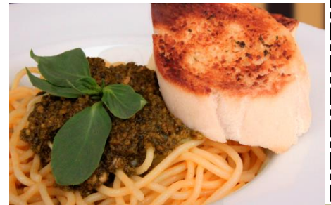
342 Pesto 160

Spaghetti with ground Beef & Tomato Sauce