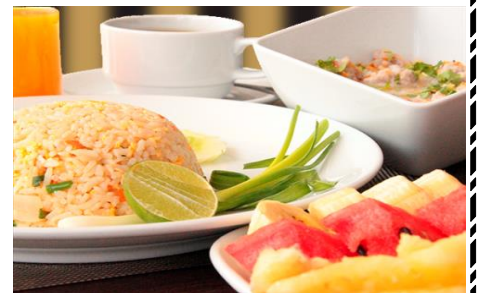
313 Thai Breakfast 180 Kaow Tom (Rice Soup) or Kaow Pad (Fried Rice) with your choice of Chicken, Pork or Beef, fresh Fruit Platter, Coffee or Tea and Fruit Juice