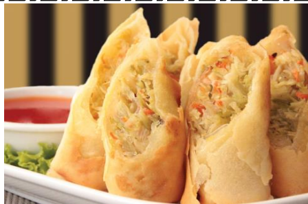
361 Vegi Spring Rolls 90

House made Chicken Spring Rolls served with Sweet Chili Sauce