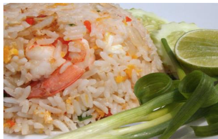
412 Kaow Pad 150 Kung/Talay ข้าวผัด กุ้ง/ทะเล