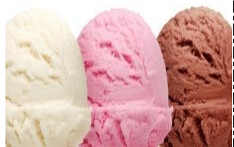
523 Ice Cream (scoop) ₪30