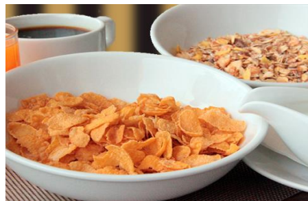
312 Healthy Choice 150 Your Choice of Muesli or Cornflakes, a fresh Fruit Platter, Coffee or Tea and Fruit Juice