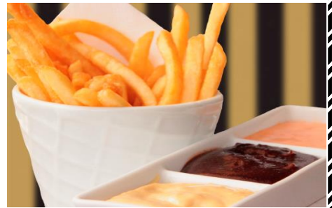
365 French Fries 70

Crispy fried Onion Rings served with a Tartar Sauce