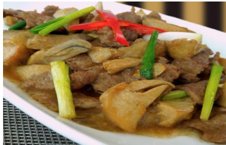
407 Nua Pad Nam 150 Mun Hoy

มัสมั่นไก่ Southern Style Curry with Chicken & Coconut