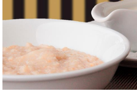
301 Porridge 80 A small Bowl of Porridge