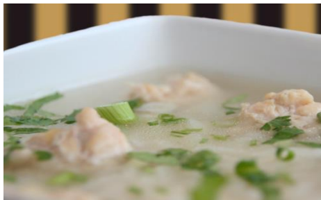
431 Kaow Tom 120 Gai/Moo/Nua