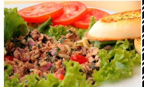
515 Mediterranean Tuna 190

Tomatoes & Mozzarella Salad served with a Balsamico Dressing