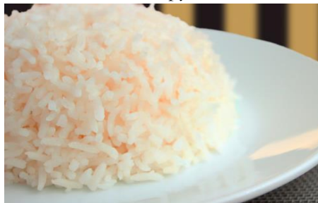
429 Kaow Suay 30