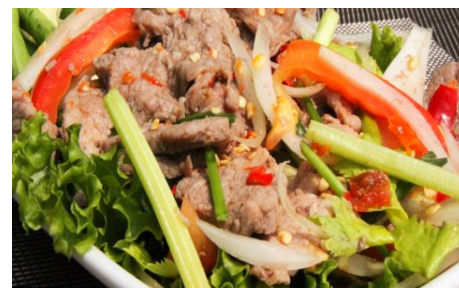
413 Yam 150 Gai/Moo/Nua ยำ ไก่/หมู/เนื้อ

Spicy Thai Salad with Chicken, Pork or Beef