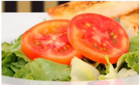
510 Green Salad 90

Green Salad with your Choice of Dressing (French, Italian or Thousand Island)