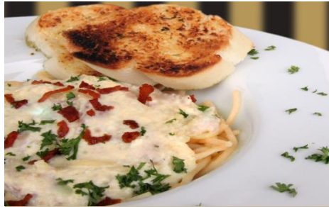
340 Carbonara 190

Spaghetti with Bacon & Egg on a creamy Cheese Sauce