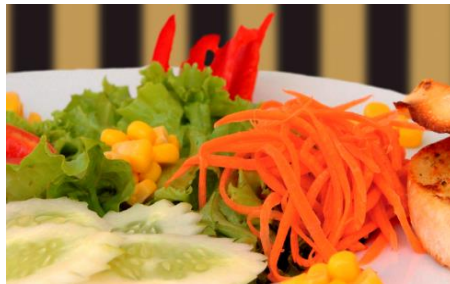
511 Mixed Salad 120

Green Salad with your Choice of Dressing (French, Italian or Thousand Island)