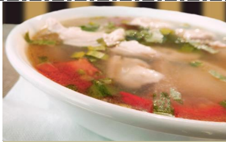
400 Tom Yum 150 Gai/Moo ต้มยำไก่/หมู