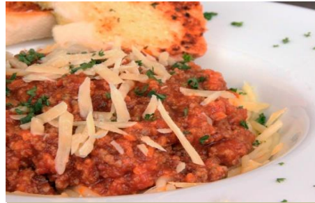
341 Bolognese 190

Spaghetti with Bacon & Egg on a creamy Cheese Sauce