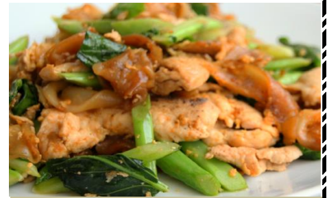
424 Pad Si Yiew 150 Gai/Moo/Nua

Chinese Noodles in a rich Sauce with Shrimp or Seafood