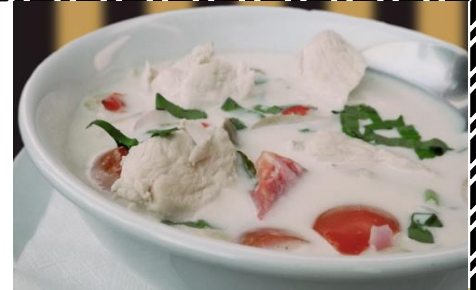
402 Tom Ka 150 Gai/Moo ต้มข่าไก่/หมู