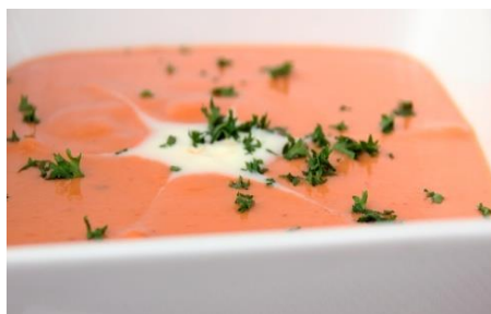
351 Zuppa Di Pomodoro 90