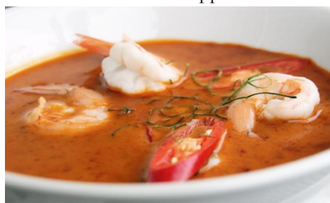
420 Paneang 190 Kung/Talay พะแนง กุ้ง/ทะเล