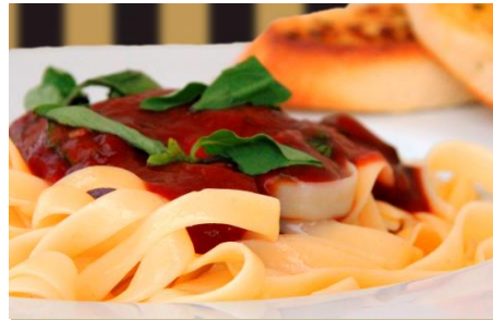
344 Napoli 150