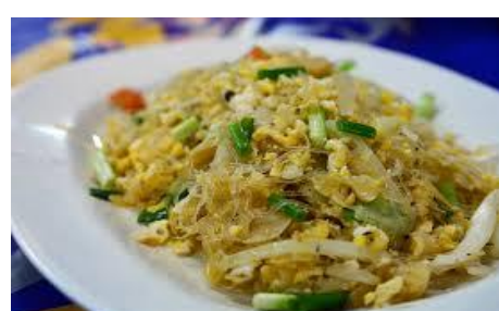
432 Pad/Wud/Sen 150 ผัดวุ้นเส้น