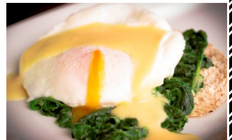
355 Eggs Florentine 190

English muffin topped with creamy Spinach, two poached Eggs and Sauce Hollandaise