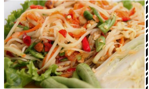
427 Som Tam Thai 140

Chinese Broccoli on a Oyster Sauce with Crispy Pork