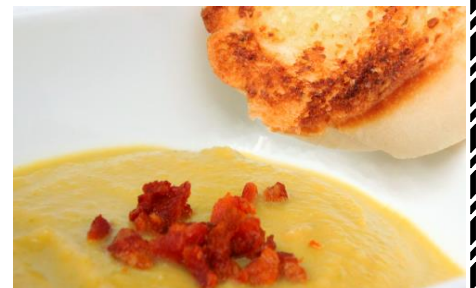
352 Spilt Pea Soup 90