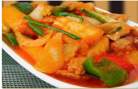
404 Priaw Wan 150 Gai/Moo

ผัดเปรี้ยวหวานไก่/หมู Sweet & Sour Chicken or Pork