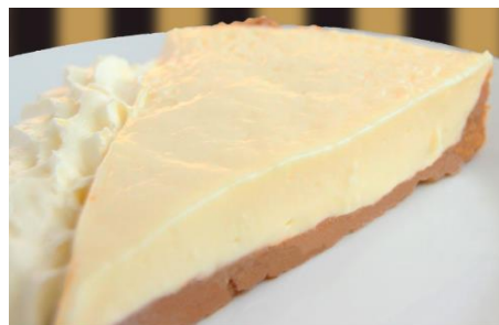
521 Key Lime Pie 140

Served with Vanilla Ice Cream & Whipped Cream