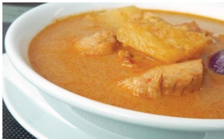
406 Massaman Gai 170

ไก่ผัดเม็ดมะม่วงหิมพานต์ Fried Chicken with Cashew Nuts