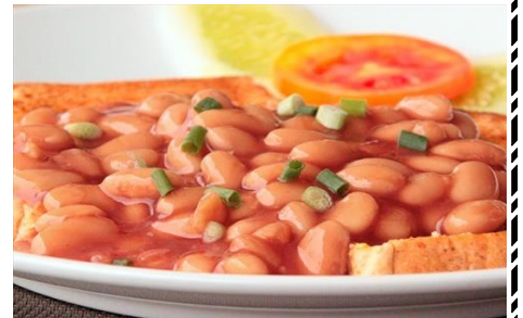
306 Baked Beans 90 Baked Beans on Toast