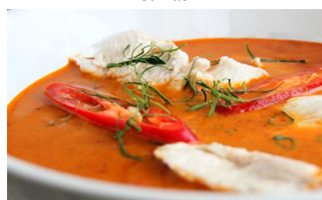
419 Paneang 150 Gai/Moo/Nua พะแนง ไก่/หมู/เนื้อ

Savory Spicy Salad with minced Chicken, Pork or Beef