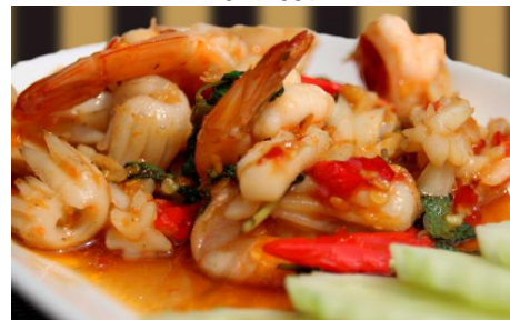
416 Pad Krapao 190 Kung/Talay กะเพรา กุ้ง/ทะเล

Sautéed minced Chicken, Pork or Beef with Chili & Basil