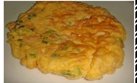
435 Kai Jeow Neab 110

ไข่เจียวหมูสับ Thai Style Omelet with Minced Pork