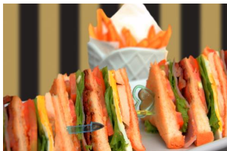
321 Classic Club 190

Bacon, Lettuce & Tomato served with a Coleslaw Salad