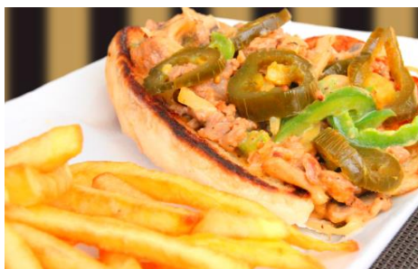
325 Philly Cheese Steak 210

Tuna with Mayo, Bell Peppers, Onion & Sweet Corn served with a Side Salad