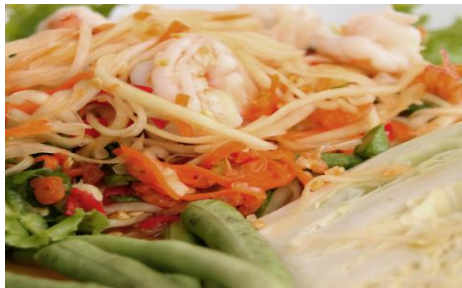
428 Som Tam Talay 190