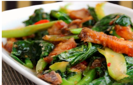
426 Kana Moo Groap 140