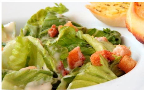
513 Caesar Salad 180