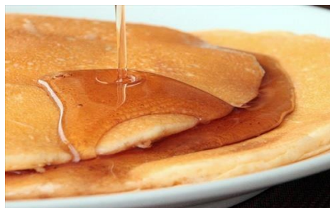
307 Pancakes 120 Pancakes & Maple Syrup