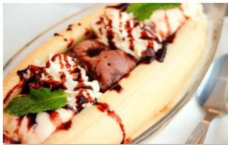
524 Banana Split 120

Fresh Bananas with Vanilla & Chocolate Ice Cream, Fudge