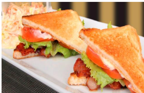
320 B.L.T 120

Bacon, Lettuce & Tomato served with a Coleslaw Salad