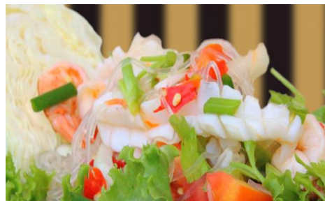
414 Yam Woonsen 170 Talay ยำวุ้นเส้นทะเล

Spicy Thai Salad with Chicken, Pork or Beef