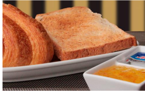
300 Butter & Jam 60 Croissant or Toast served with Butter and Jam