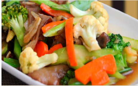
425 Pad Pak Ruam Mit 110

Chinese Fried Noodles on a Soy Sauce with Chicken, Pork or Beef