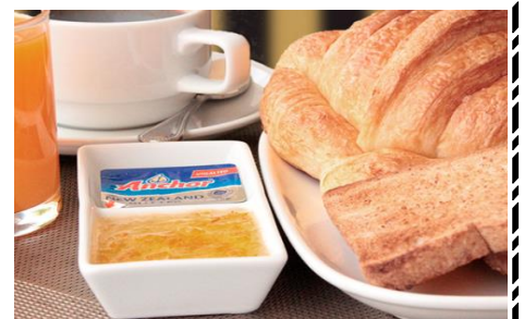
310 Continental Breakfast 120 Croissant or Toast with Butter and Jam, Pot of Coffee or Tea and Fruit Juice