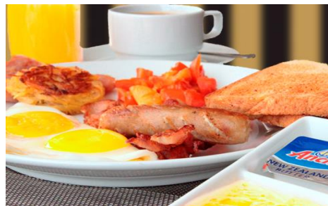
311 American Breakfast 180 Two Eggs (Any Style), Bacon, Ham, Sausage, Hash Brown, Tomatoes, Toast, Coffee or Tea and Fruit Juice