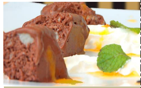
527 Ice Cream (scoop) ₪140