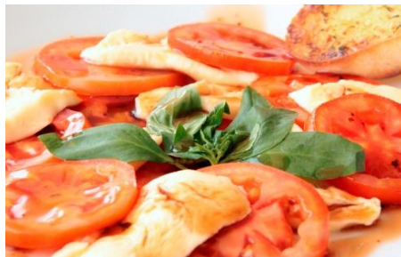
514 Salad Caprese 130

Tomatoes & Mozzarella Salad served with a Balsamico Dressing