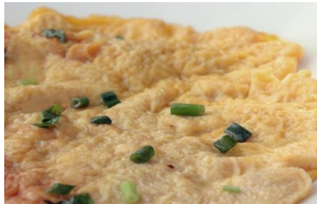
410 Kai Jeow Moo Sap 110

ไข่เจียวหมูสับ Thai Style Omelet with Minced Pork