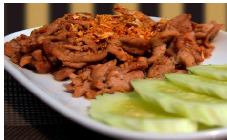
417 Gai/Moo/Nua 150 Tord Gratiem Prik Tai

Sautéed Shrimp or Seafood with Chili & Basil