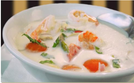
403 Tom Ka 190 Kung/Talay ต้มข่า กุ้ง/ทะเล