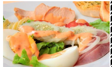
512 Chef Salad 160

Mixed Salad with your Choice of Dressing (French, Italian or Thousand Island)