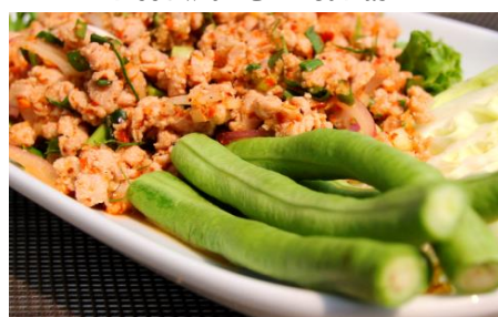
418 Laab 150 Gai/Moo/Nua ลาบ ไก่/หมู/เนื้อ

ไก่/หมู/เนื้อ ทอดกระเทียมพริกไทย Fried Chicken, Pork or Beef with Garlic & Pepper