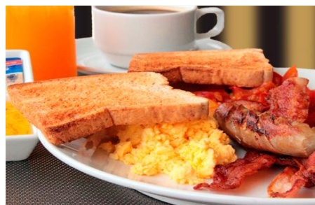
309 English Breakfast 150 Two Eggs (Any Style), Bacon, Sausage, Fried Tomatoes, Toast, Tea or Coffee and Fruit Juice