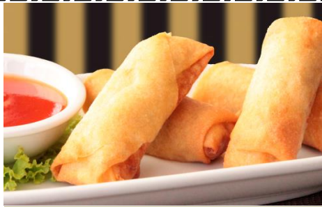
360 Chicken Spring Rolls ₱90

House made Chicken Spring Rolls served with Sweet Chili Sauce