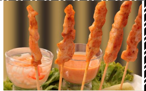
362 Chicken Satay 90

Vegetable Spring Rolls served with Sweet Chili Sauce