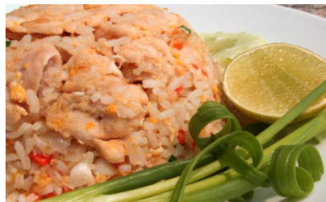
411 Kaow Pad 120 Gai/Moo/Nua ข้าวผัด ไก่/หมู/เนื้อ