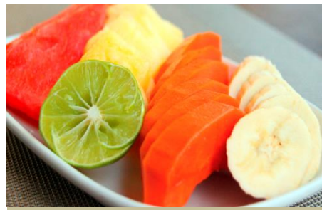
526 Fruit Platter 60

Fresh Bananas with Vanilla & Chocolate Ice Cream, Fudge