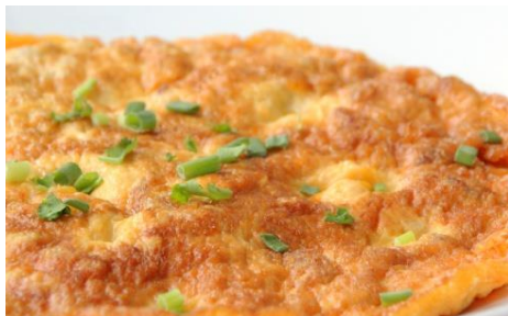
409 Kai Jeow 90

เขียวหวานไก่/หมู/เนื้อ Green Curry with Chicken, Pork or Beef