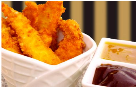
363 Chicken Fingers 90

Sautéed Chicken Skewer served with a Peanut Sauce